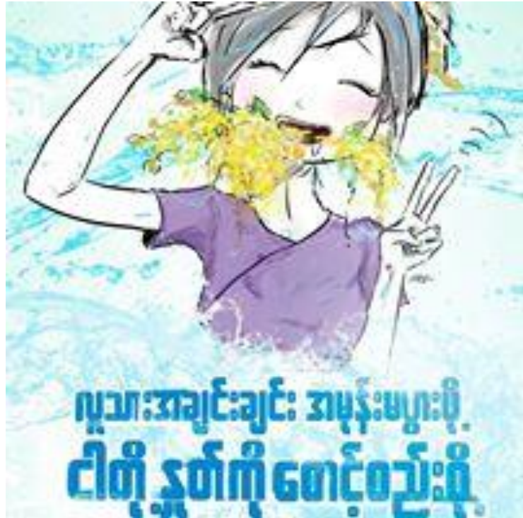
Logo of the Panzagar Campaign.

Though internet penetration remains very limited, particularly in rural areas, access will soon increase dramatically. So-called “love speech” campaigns, such as the Panzagar or “no dangerous speech” campaign, which attracted almost 10,000 Facebook followers in less than a month since its launch during the Thinjan festival 2014 77 . The campaign combines several elements which may have been instrumental in its popularity, namely combining highly visible offline events with intensive online multimedia campaigning, associating with notable personalities, and employing a meaningful and memorable symbolism (yellow Thinjan flowers in followers’ mouths, to depict “love speech”).