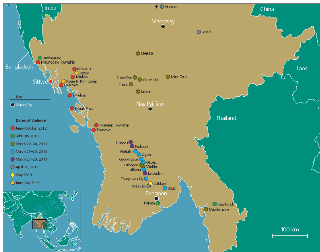
Sites of intercommunal violence June 2012 - August 2013.

Intercommunal violence in Myanmar has followed a geographical pattern during the transition period, taking place to a large extent in clusters of townships at different times. The violence began in Rakhine State between July – October 2012, before surfacing in Mandalay Divisions (and to a much lesser extent Mon State) between 20 – 24 March 2013, quickly followed by outbreaks in Bago, Yangon and Ayeyawaddy Divisions in following days 66 . The number and frequency of violent incidents declined after March, though incidents spread to other parts of the country including Shan and Kachin states (April) and Saigang Division (August). Violence also resurged in Rakhine State in Kanbalu township (October) and in Daw Chee Yar Tan (January 2014).