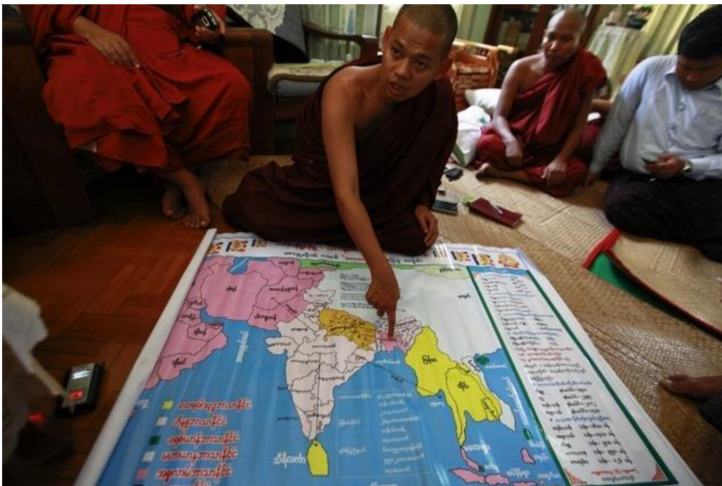
Buddhist monk points to Bangladesh on a map of dominant religions by country.

Fear of demographic besiegement is not limited to Muslims. It is widely recognised that Myanmar is bordered by the heavily-populated and non-Buddhist China, India and Bangladesh. Unchecked immigration from China since the 1980s is estimated to have resulted in 2 million illegal Chinese immigrants living in Myanmar, which has exhibits signs of tension between Buddhist and Chinese cities in places such as Mandalay 13 .